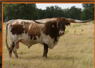
COWBOY UP CHEX