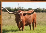
RC PACIFIC MERMAID